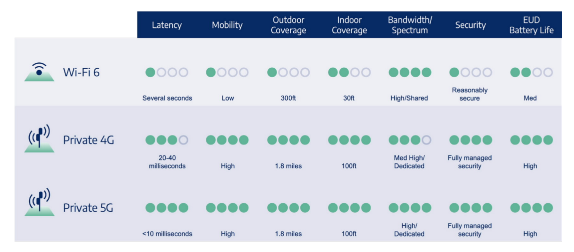
Figure 1: When to consider Private 4G/5G

Wi-Fi 6 provides high bandwidth for a limited number of devices, is cost effective, and is easy to access. However, Wi-Fi struggles when latency, mobility, coverage, and security are required (see Figure 1). For business-critical applications, Wi-Fi is not the best solution.